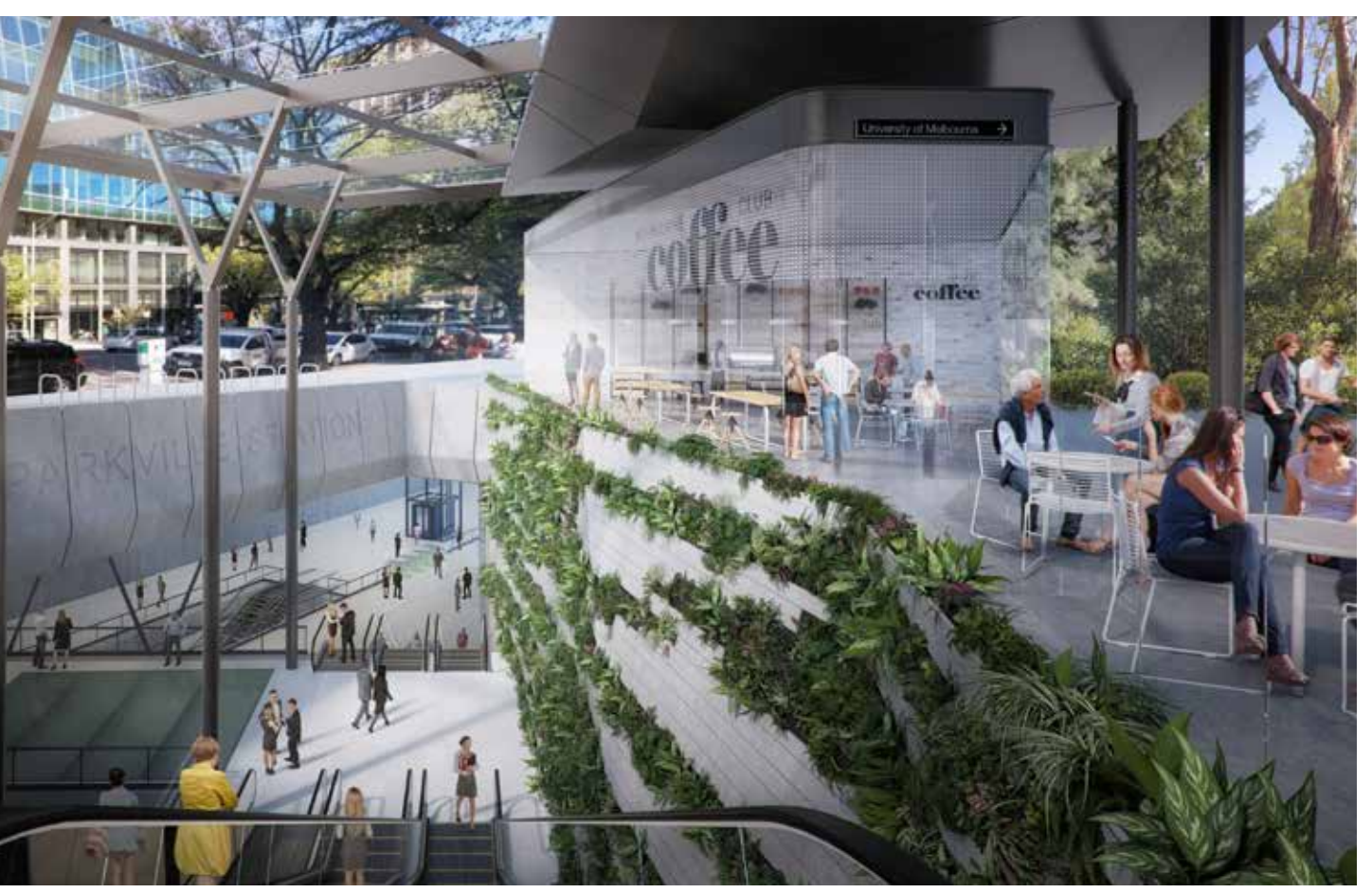
Melbourne Metro Rail Parkville Station (artist impression)

The discount rate methodology in the National PPP Guidelines is not appropriate for use in making the investment decision or applying to the cost benefit analysis.