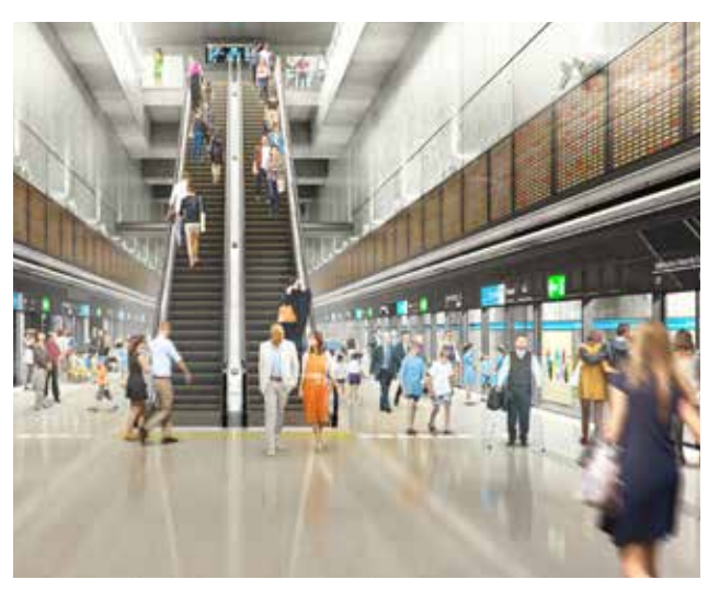
Melbourne Metro Rail Parkville Station (artist impression)

Any scope changes or cost movement against the PSC should be justified by a full value-for-money analysis. The scope ladder is evaluated as part of the net present cost risk adjusted cost of the proposals.