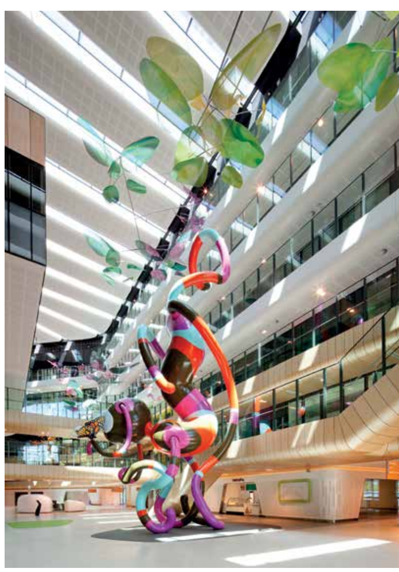
Royal Children's Hospital

DTF can advise procuring agencies on the form and content of each sign off. The project director will sign an overarching assurance and is responsible for coordinating the sign off process and providing copies to DTF.