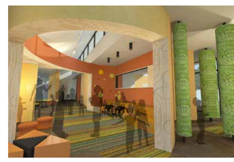
New schools PPP project (artist impression)