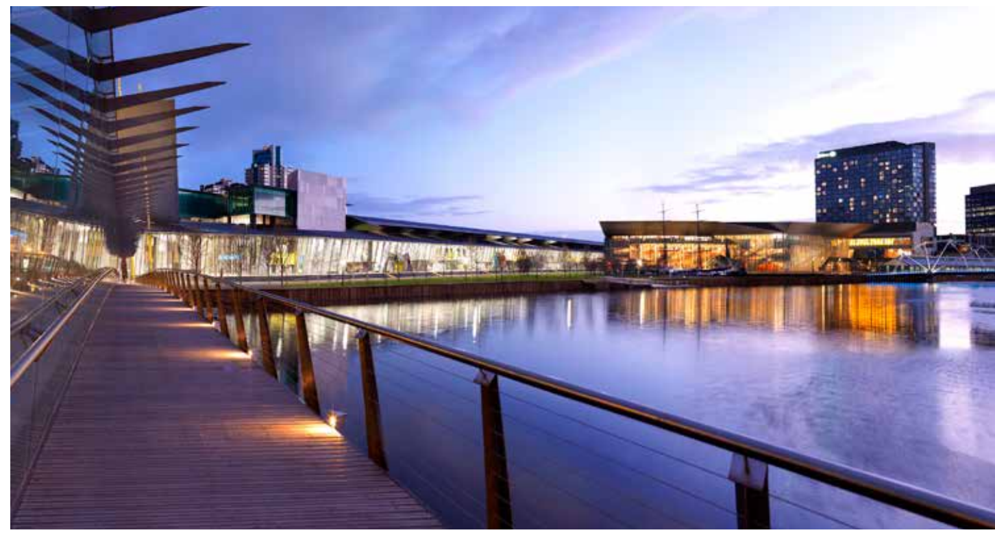
Melbourne Convention and Exhibition Centre

Additional Government approvals are required where there is: