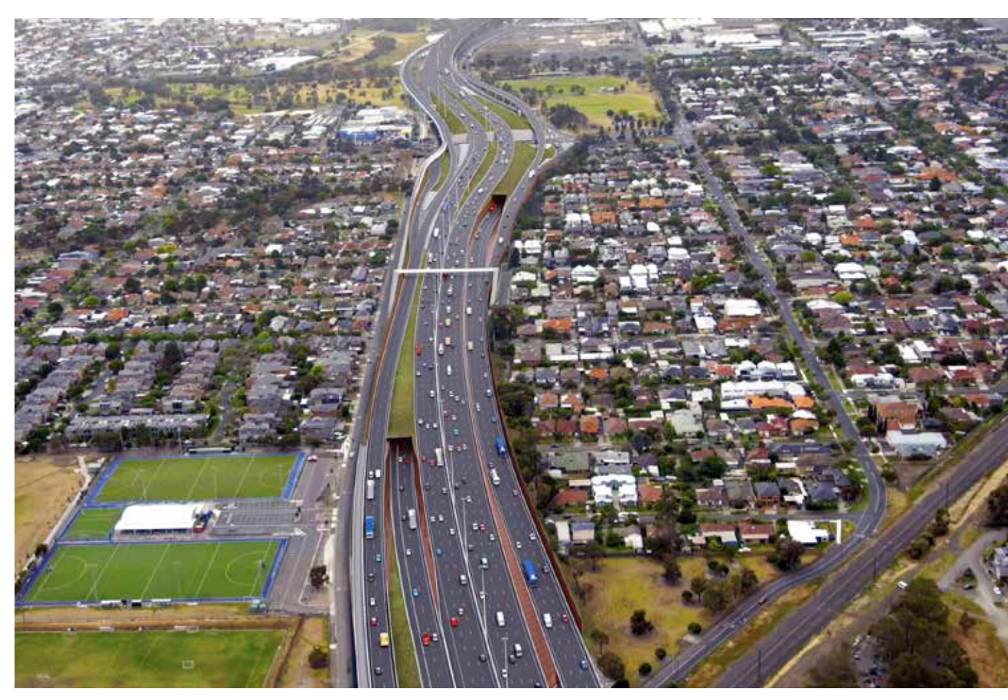
Western Distributor (artist impression)

Market-led proposals directly related to PPP contracts or that progress as PPP contracts must comply with the National PPP Guidelines and the Partnerships Victoria Requirements.